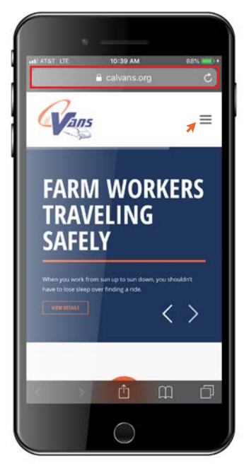
Click on the three lines on the top right corner.

CalVans website is mobile friendly, to check the billing on your phone, you'll need to click on your phones preferred search engine, go to the address bar and enter the CalVans website, www.calvans.org Follow the steps below to check your billing. We encourage everyone to take advantage of these new updates.