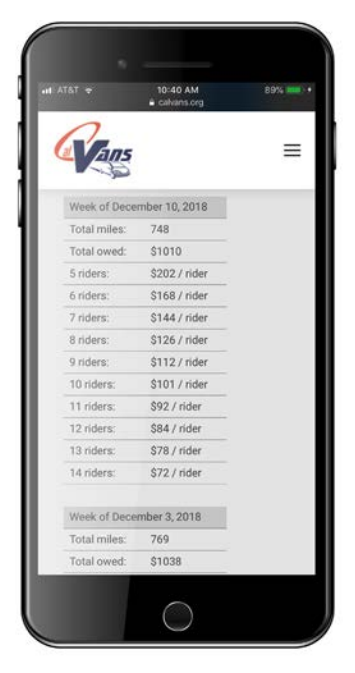
The billing for the past five weeks will appear.