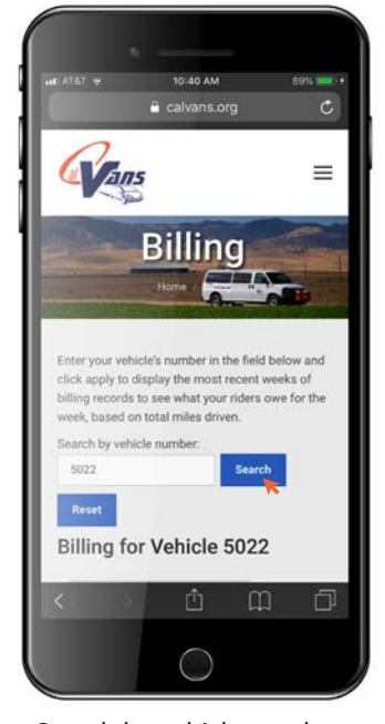
Search by vehicle number.